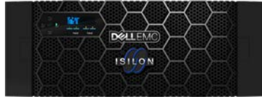
Dell EMC Isilon A2000