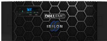
Dell EMC Isilon F800 All-Flash

The new generation of Isilon hardware systems allow you to consolidate and support a wide range of file workloads. With an ultra-dense, modular architecture that provides four Isilon nodes within a single 4U chassis, Isilon systems enables organizations to reduce data center space requirements and related costs by up to 75%. The new Isilon platforms seamlessly integrate with existing Isilon clusters.