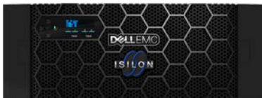
Dell EMC Isilon H600