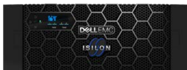
Dell EMC Isilon H400