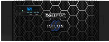
Dell EMC Isilon A200