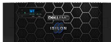
Dell EMC Isilon H500